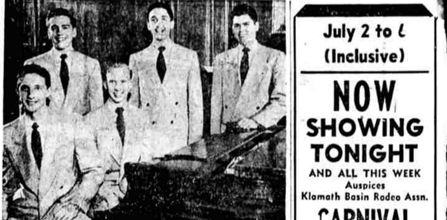
THE WESTMONT QUARTET (above), of Westmont College, Santa Barbara, is to present a program of sacred music at the Bible Baptist Church here, July 4, 7:30 p.m. The public is invited.