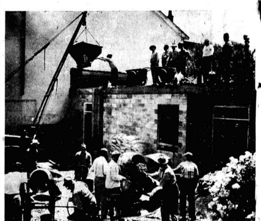
KLAMATH TEMPLE'S new annex is rapidly taking shape with many volunteer workers aiding. The $30,000 project will give the Temple nine Sunday School rooms, a small auditorium, baptistry and other facilities.