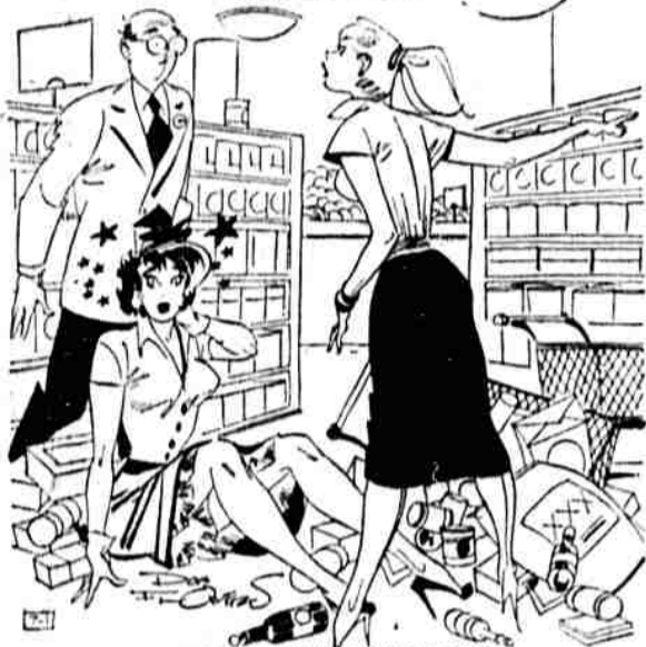
"It was a hit-and-run! She went that way!"