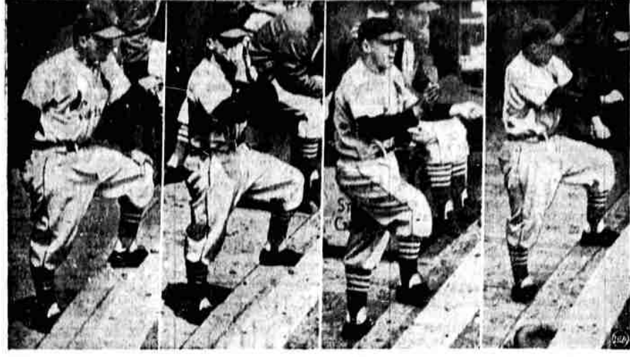
MANAGER STANKY —Eddie Stanky is a take-charge guy in the dugout on the field. The fiery Cardinal manager (left) studies the opposition's plan of attack. He cups his hands and shouts encouragement to his pitcher, claps his hands when the Redbirds come off the field, then signals the batter to hit away.