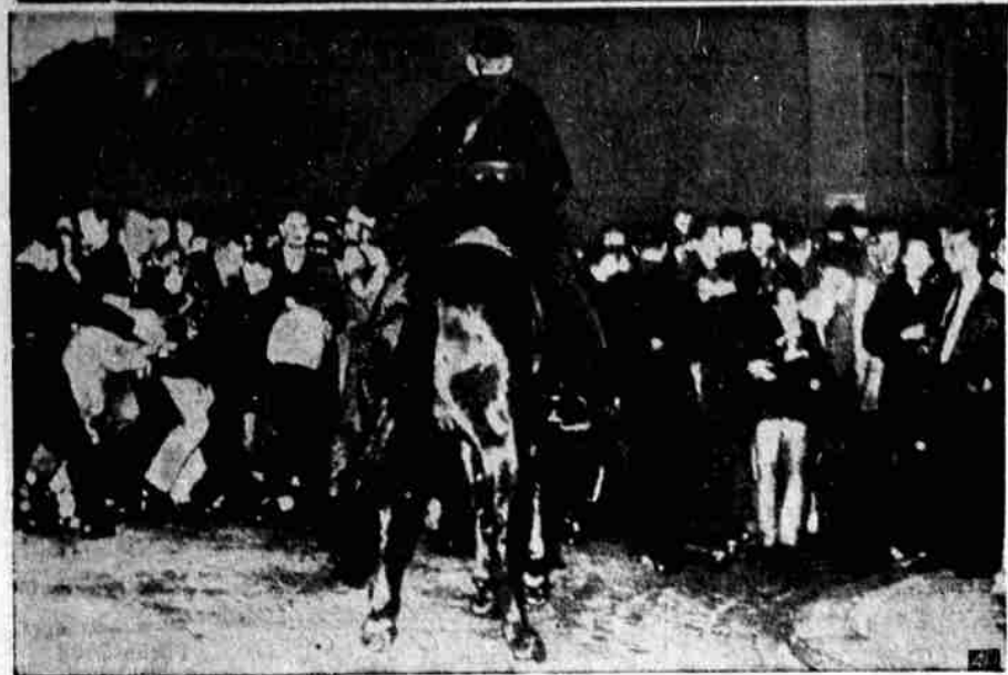
SWEDES DEMONSTRATE OUTSIDE SOVIET EMBASSY—Police restrain crowd of demonstrators outside Soviet embassy in Stockholm, protesting the shooting down of an unarmed Swedish Air Force plane by Soviet jet fighters while on a search mission over the Baltic. The enraged demonstrators yelled "we will see Stalin hanged," and "down with the Communist war-mongers." Infuriated Sweden kept up her search for the missing transport plane and sent along jet fighter escorts with orders to shoot if the Russians attacked.