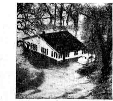
Cor Rises Over Flood. Floods often rise over cars, but this householder in Winnepig turned the tables. Each day water rose, he hoisted his car higher.

...and so does everybody else. ... If you're selling something that's advertised, make sure it's advertised to all the people in town who can possibly buy. ... Just as you read the paper now, all your customers and prospects read the paper too - at the time they choose, for as long as they choose - for the advertising as well as for news or for fun. ... When your selling is backed by newspaper advertising, your story has a chance to reach everybody. Your audience isn't just comedy fans, or mystery fans, or sports fans... but everybody. ... Is it any wonder that advertisers today invest far more of their money in newspapers than in any other form of advertising? ... Only the newspaper is first with the most news... first with the most people... first with the most advertisers!