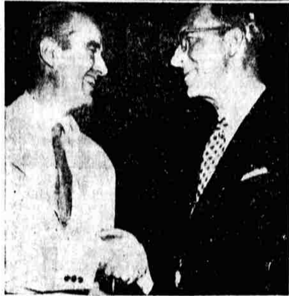
SHAKE HANDS AND COME OUT FIGHTING —Mutual Security Director W. Averill Harrington, (left) and Senator Estes Kefauver shake hands at Washington, D. C., as they wind up their campaigns for the District's six Democratic convention votes.