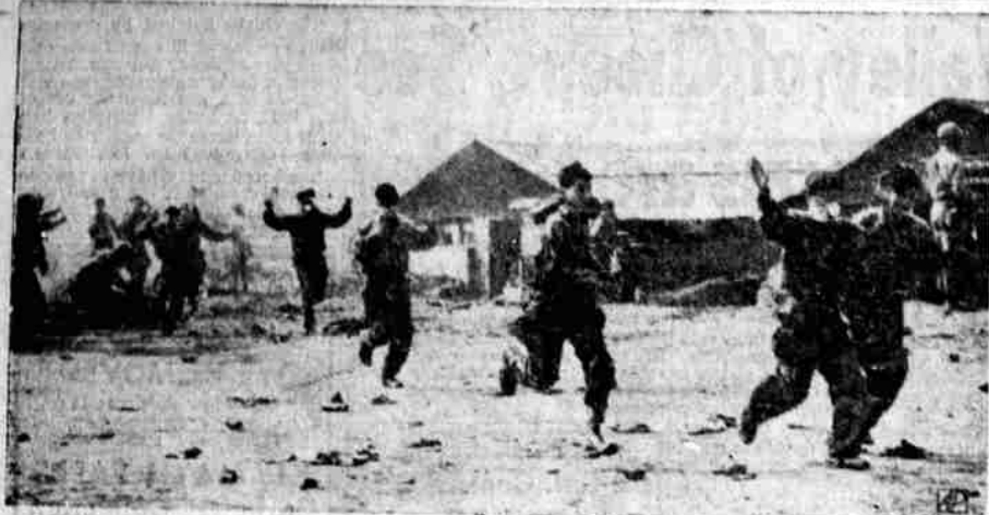
ROUTING RED PRISONERS—Red prisoners run from tear gas and burning huts at hard-hitting U.S. paratroopers move in (June 10) to clean out Compound 76 at Kojima Island prison camp. Many die-hard Communists used home made gas masks in effort to prolong bloody resistance to soldiers. One prisoner struggles with paratrooper on ground (left).