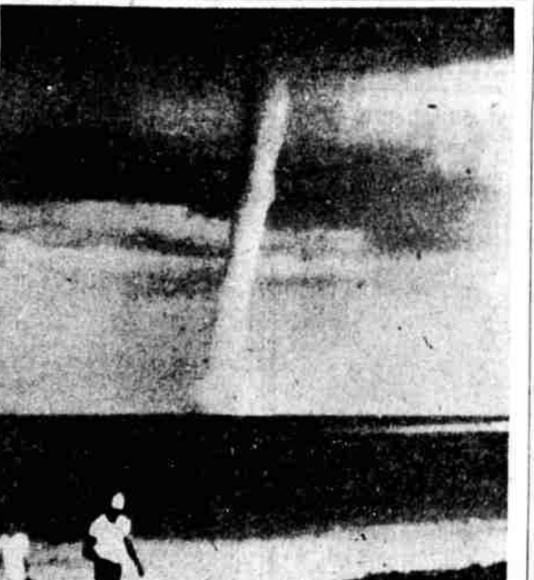
BATTEN DOWN THE HATCHES—This huge waterspout geyser force offshore in Tampa Bay as it heads inland. The whirling funnel crashed into St. Petersburg, Fla., causing damage estimated as high as $75,000.