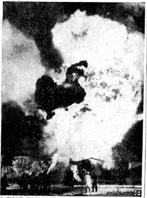
A GIANT FIREBALL explodes above burning warehouse of the Witco Chemical Co., as fire swept the plant in Stickney, Ill. Firemen reel back from the blast which caused an estimated damage of $500,000. The warehouse contained drums of mastic and drier.