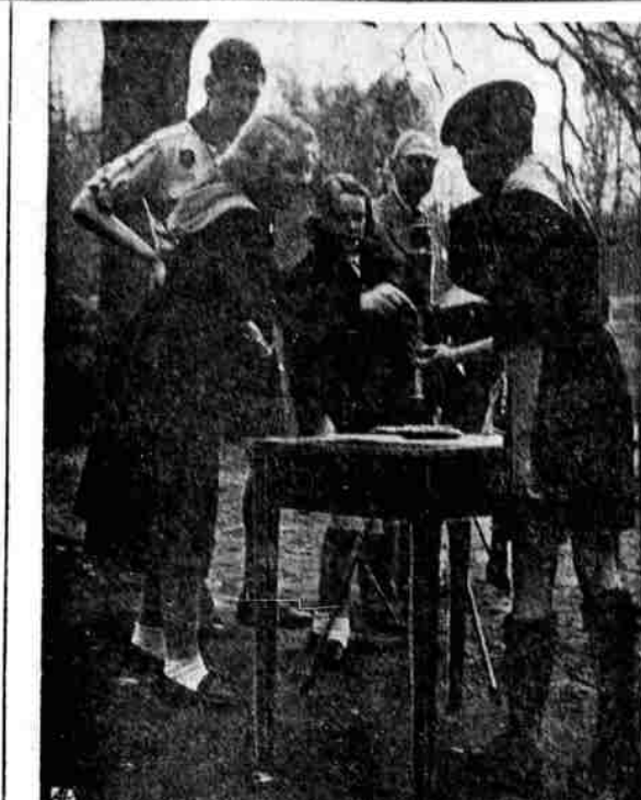
PRINCESS PAYS —Princess Beatrix, left, eldest daughter of Queen Juliana of the Netherlands, pays scout for removing fallen branches at Soestdijk Palace. In center is Princess Irene.