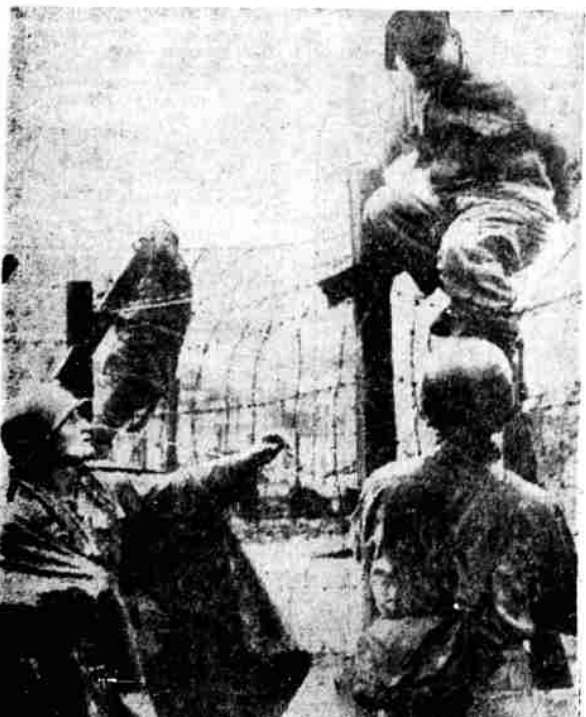
BREAK FROM RED COMMISSARS —Two Communists who broke away from the main group of prisoners being transferred from Compound 77 clamber over the barb wire fence into the waiting arms of U. N. guards. More than 400 of the anti-Communist war prisoners risked their lives in a break for freedom from the fanatic Red commissars who have murdered at least 131 of their comrades on Kojave Island.