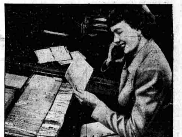
Making it pleasant for you to do business with us is the aim of our business office people who serve you.