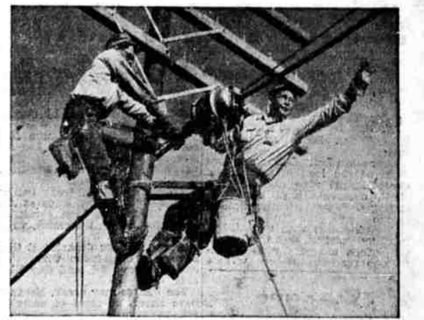
No one can guess the importance of the calls which will flow through the cable these linemen are installing.