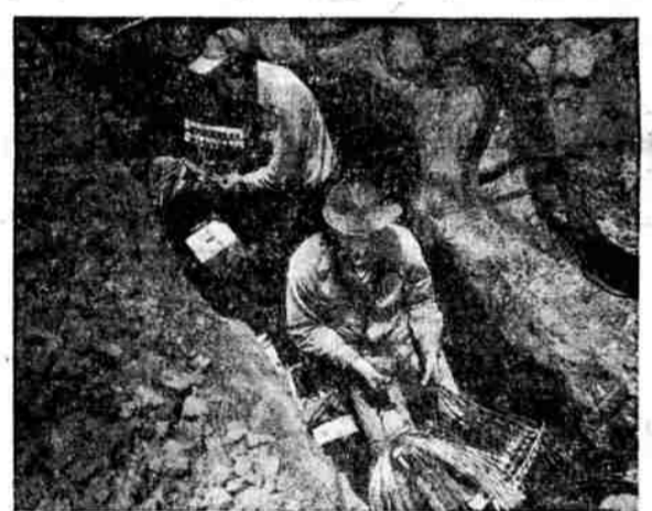
When trouble strikes, by day or night, telephone men get going fast to keep your telephone always at your service.