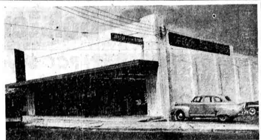
NEW OREGON FOOD STORE —This new Oregon Food Store at 1315 Oregon Avenue will have a grand opening celebration this week. The new store features a complete stock of groceries and produce self-service meats and a large housewares department, which will also include drugs, toiletries, toys and sundry items.

SEE YOUR NEAREST OLDSMOBILE DEALER DICK B. MILLER CO. 7th and Klamath Phone 4103 THE KEYS ARE WAITING! DRIVE OUR SPECIAL "ROCKET" SHOW CAR TODAY!