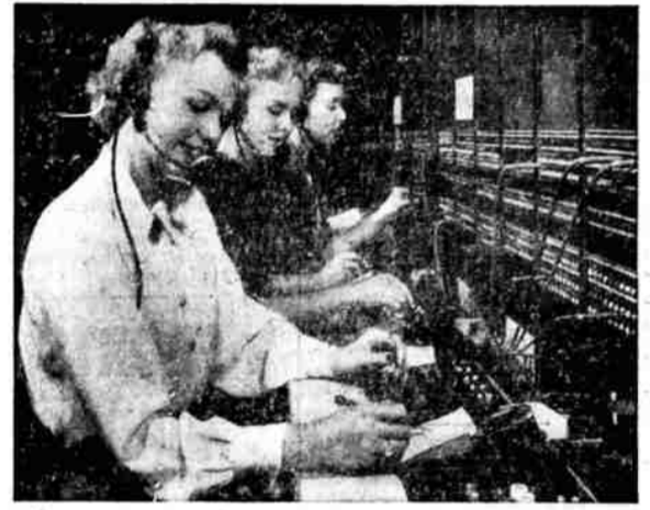
The capable hands of telephone operators are ready to put your calls through—when you want, where you want.