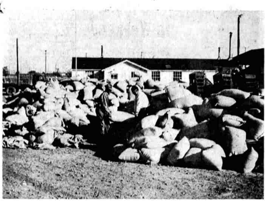
TONS OF POISON BRAN being used to knock down a severe infestation of grasshoppers pile up at Newell, headquarters for the grasshopper war. The bran is loaded in airplanes and scattered around infested areas. Some 25,000 acres of barley are to be treated.