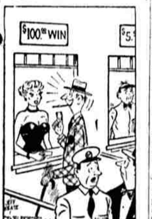
"This was when they lose, they feel they've at least got some pleasure from betting that much!"