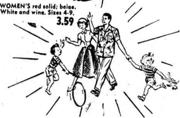
WOMEN'S red solid; beige, white and wine. Sizes 4-9.

Junior brother, sis, mom and dad . . . put new emphasis on the word "comfort" when they slip into these. Cushiony rubber soles take the hard jolts out of walking . . . airy cotton fabric uppers "breeze-condition" your feet. Choice of styles, sizes and colors for every member of the family . . . so bring them all down to Sears. Outfit them now for a full summer of fun.