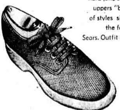
MEN'S brown, navy and blue denim. Sizes 8-12.