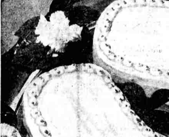
Bride-and-Groom Cake tastes better MADE at home!