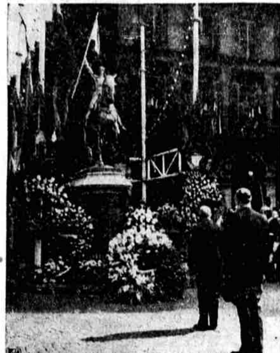
HONOR PATRIOT SAINT —President Vincent Auriol and Defense Minister Rene Pleven (nearest camera) stand at flower-decked statue of Joan of Arc in annual Paris ceremony.