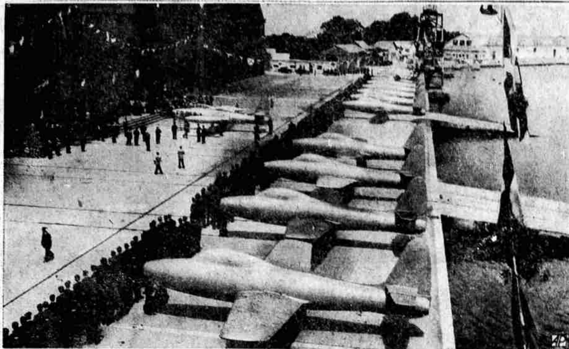
ADDING TO NATO'S AERIAL STRENGTH —This is ceremony at Brindisi, Italy, in which 19 Thunderjets were presented to Italy by the United States to bolster her aerial strength as part of the North Atlantic Treaty Organization.