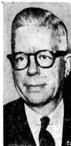
ADDS NEW POST —Henry H. Fowler, Administrator of National Production Authority, was nominated by President Truman also as Defense Production Administrator.