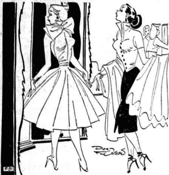
"It all boils down to whether you'd rather swish or rustle."