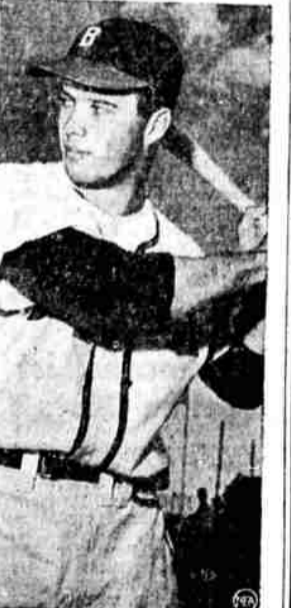
HEFTY HITTER—Appraisers call 20-year-old Ed Mathews the greatest power hitter in Boston Braves' history. The six-foot-one-inch, 200-pound third baseman struck seven homers in the first 24 games.

By The Associated Press INTERNATIONAL LEAGUE Toronto 8 Buffalo 2 Rochester 11 Syracuse 1 Other games postponed AMERICAN ASSOCIATION Columbus 4 Toledo 2 Louisville 7 Indianapolis 5 Milwaukee 7 Kansas City 4 Minneapolis at St. Paul, postponed TEXAS LEAGUE Dallas 3 Tulsa 0 Fort Worth 7 Oklahoma City 2 San Antonio 5 Beaumont 3 Houston 6 Shreveport 2 PIONEER LEAGUE Ogden 5 Salt Lake 4 Magic Valley 5 Boise 4