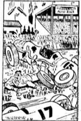
"Darn it—I swallowed my chewing gum!"