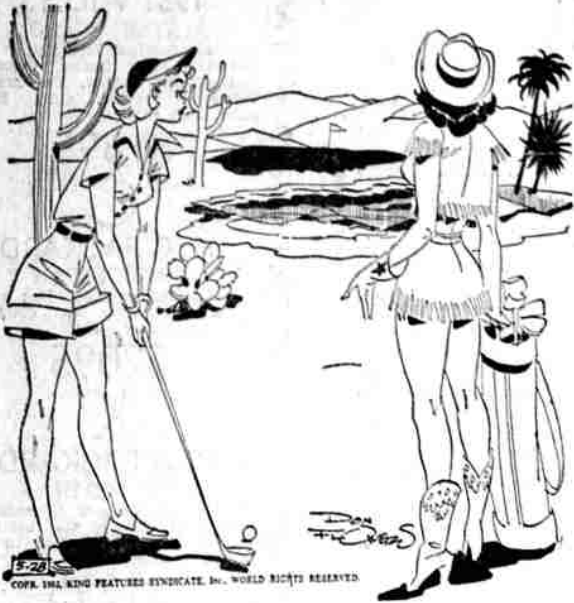
"Pay no attention to our water hazard. It's a mirage."