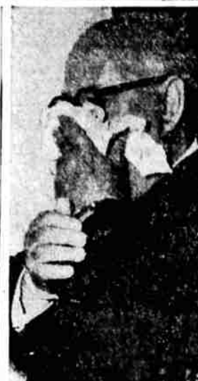
PEEK-A-BOO — Although he is under sentence of 25 years to life in prison in New York and has been photographed frequently, Waxy Gordon, 63, kept his face well covered in San Francisco as he was brought into Federal Court for arraignment on two counts in a narcotics conspiracy indictment. He pleaded innocent. He was one of 23 indicted in a nationwide distribution ring dealing in millions of dollars worth of narcotics.