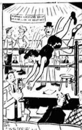
"Let's see if we can persuade the winner to say a few words."