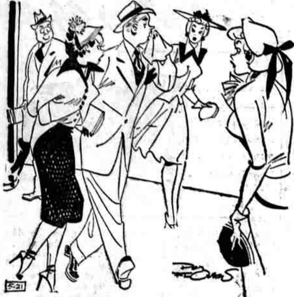
"You beast! You're just letting your nose bleed so people will know that I hit you!"