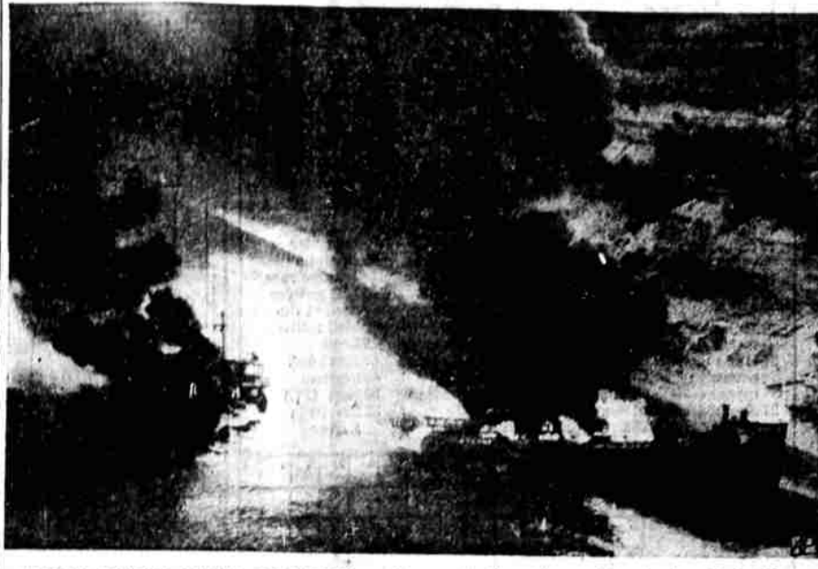
TANKER BURNS AFTER COLLISION — Fore and aft sections of the tanker F. L. Hayes burn, sending dense columns of smoke skyward after it caught fire following a collision with a freighter in the Chesapeake and Delaware canal south of Wilmington, Del.

The Kefauver people claimed they have enough strength to push through a motion for instruction from the floor.