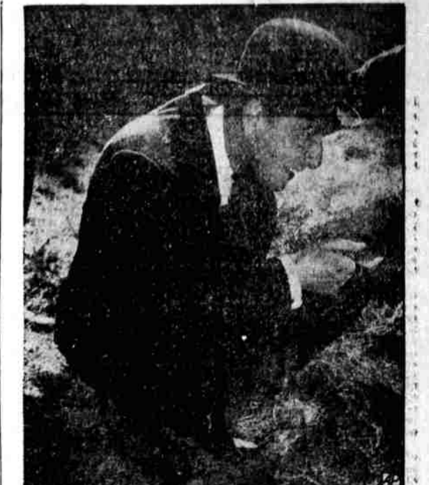
OFFICIAL INSPECTION — British War Minister Anthony Head, in derby, looks at a foxhole dug by British troops on maneuvers near Soltau during his tour of West German units.