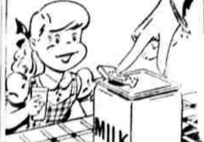
Easy to Close!

Coming June 1st Your Milk In This Carton