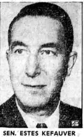
SEN. ESTES KEFAUVER

All qualified voters living within the city school district are eligible to vote.