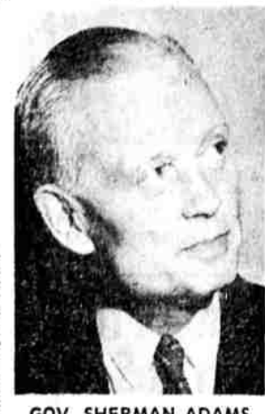
GOV. SHERMAN ADAMS