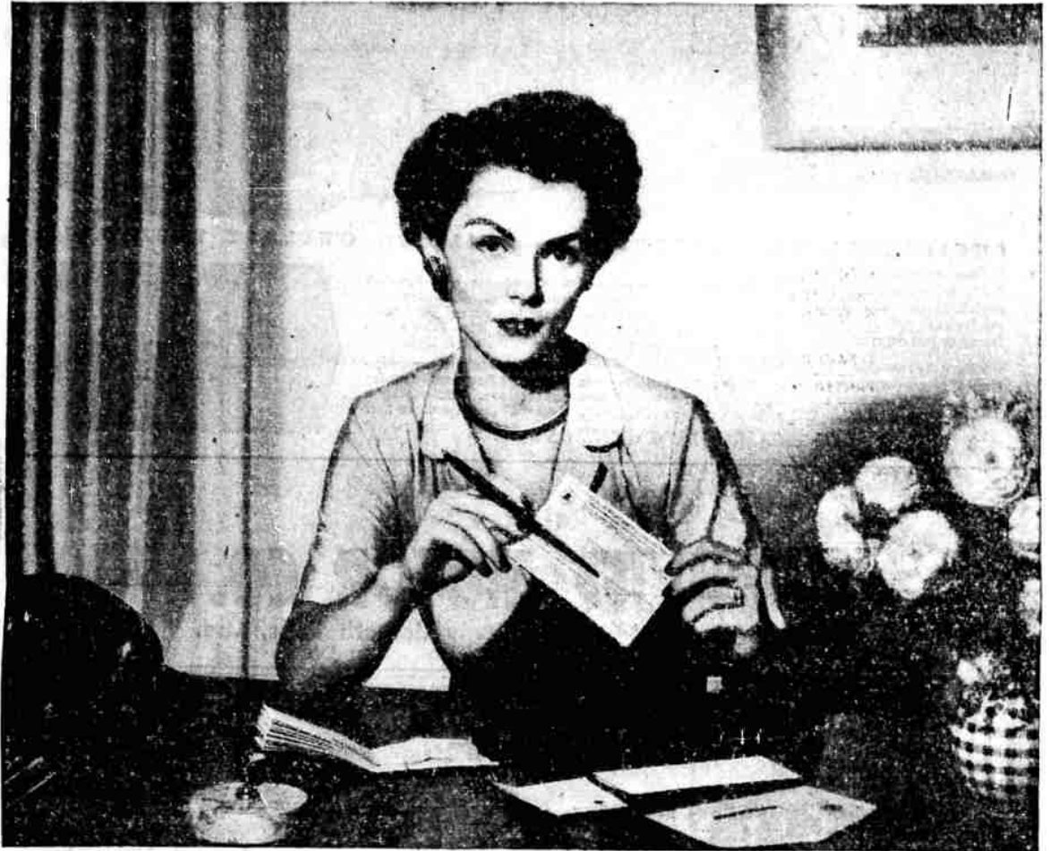
When you pay your telephone bill, about 28 cents of each dollar goes for excise, income, property and other taxes.