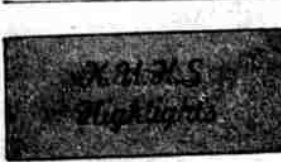
By JEAN OWENS

Wards bought the entire inventory stock of a famous manufacturer to bring you this special sale. These are all smartly tailored, short-sleeve shirts of fine Sanforized cottons and hand washable rayons. You'll find crisp, printed cotton plisses, colorful woven plaid cotton broadcloths, smooth rayons in handsome tropical prints, two-tone effects and solid colors. All men's sizes. Buy now and save.