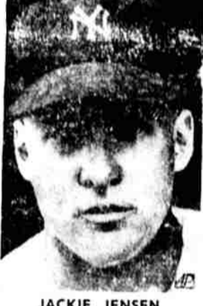
JACKIE JENSEN likes change