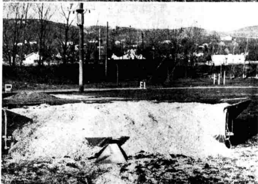
BEFORE AND AFTER —Here's Bob Hendershott's portable jumping pit, rapidly gaining prominence after almost five years on the market and recently publicized in Popular Mechanics. The top photo is before assembly. Below, it's ready to go.