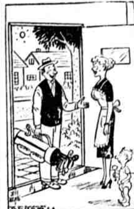
"Had a wonderful round, Dear! My boss beat me by 18 strokes!"