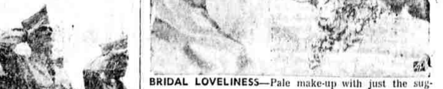
PRIDE in the uniform goes with pride of country, is one of the film themes. The best preparation for service is good citizenship before and after military training.