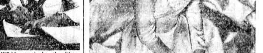
CONFUSED—This young man wonders what induction will mean to his future.

They resulted from studies that showed many boys were confused as to what they ought to do before going into service and what the results of such duty would be. Here are some scenes taken from the 14 short films which have been produced in the project.