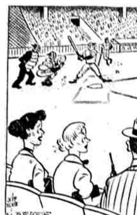
"What a dull game—eight innings and neither side's even got a hit!"

National League Umpire Augie Donatelli was a tail gunner on a B-17 during World War II. He was captured by the Nazis and held prisoner for 15 months.