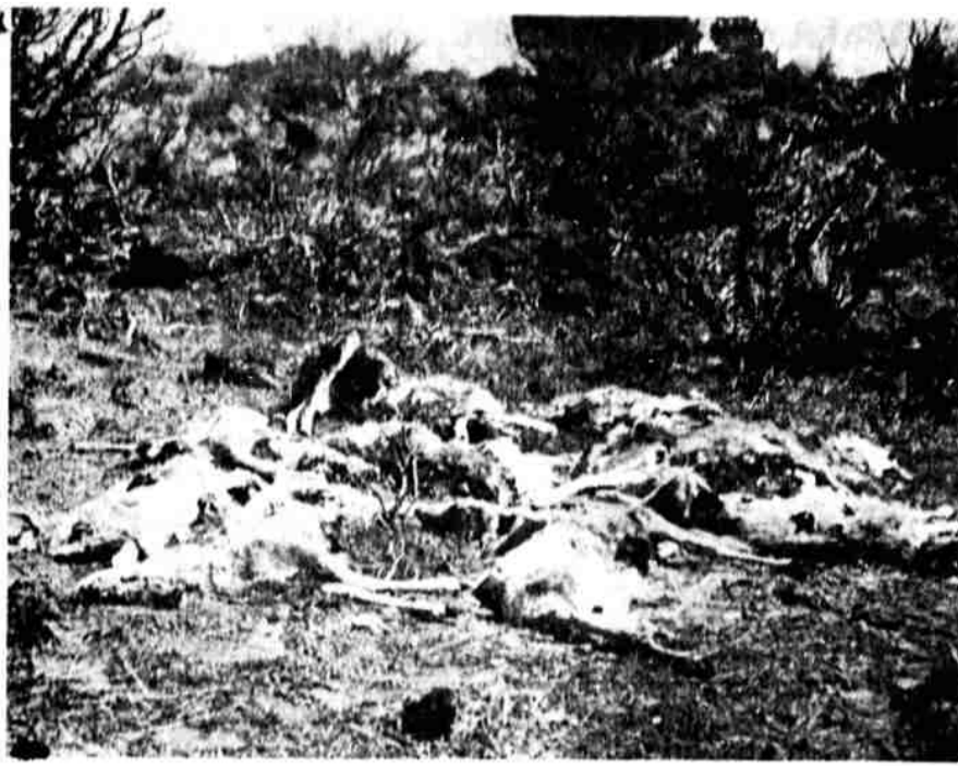
TRAGEDY —An estimated 5,000 deer died this past winter on the concentrated deer range south of Tulelake, according to a recent survey by forest and game officials. The count was taken in the area to the north of last year's big Modoc fire. Here a group of nine carcasses deteriorate on a range grazed clean of browse and foliage. Note bare-limbed branches on bushes in background.