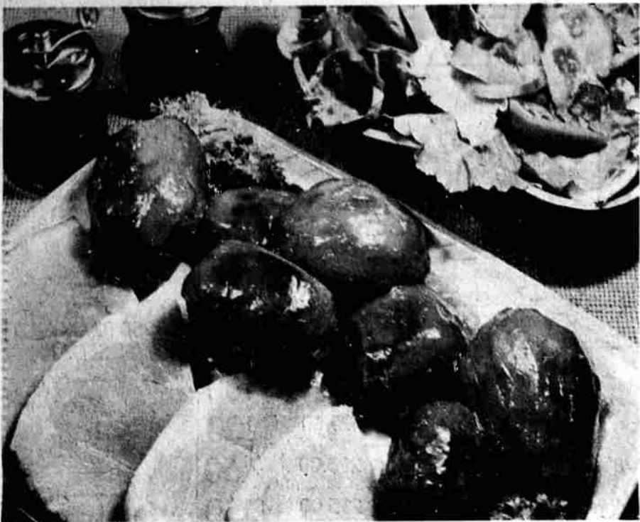
HAM WHAT AM is one of the least expensive meats for Spring dinners. Serve with glazed yams, also plentiful yet, slightly seasoned with maple flavoring, a tossed green salad with plenty of tomatoes. Be sure to have ham cut in slices at least one half inch thick. Use any left over bits of meat in diced, creamed potatoes.