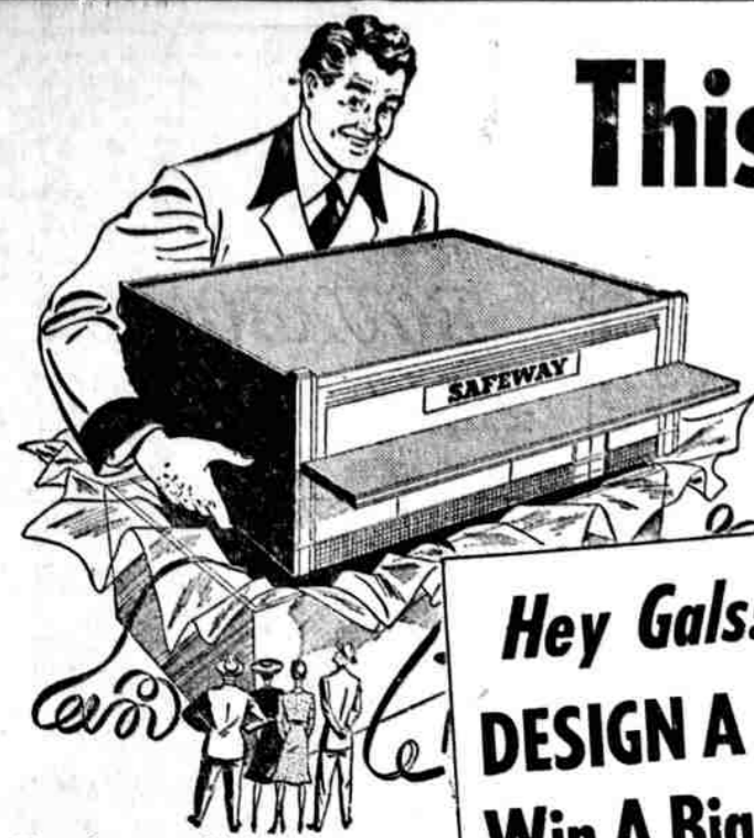
Meet the men who will be in charge of this new Safeway Store