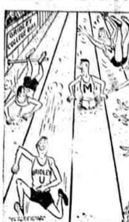
Yeah, and ask the Gridley U officials about it and just watch them act innocent!