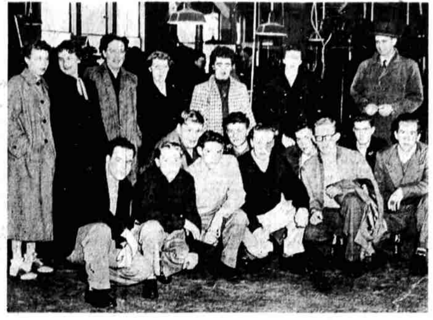
OREGON TECH was host recently to 14 Bend High Schol students and three instructors. The group is shown above in one of the many shops at the hilltop institute. The public is invited to tour the OTI layout April 25.