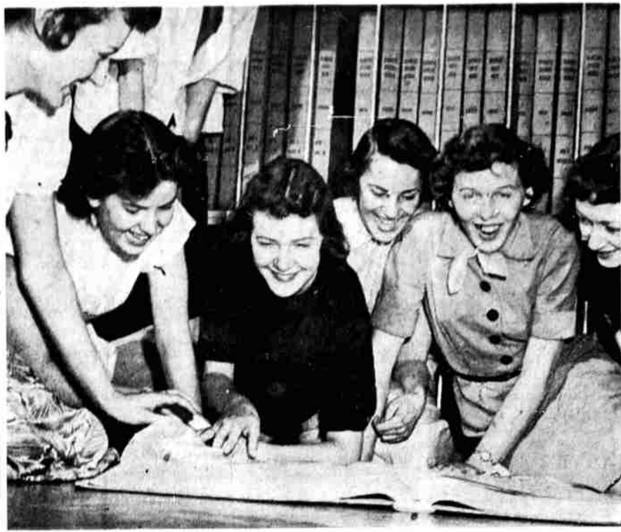
FILES OF NEWSPAPERS of 15 or 16 years ago were of particular interest to these girls of the Henley High junior class who visited the Herald and News plant this week. The girls thumbed through the old papers, trying to find their own birth notices.