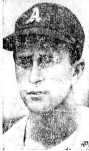
BOBBY SHANTZ throttles Bombers