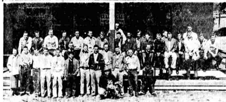
TWO GROUPS of Klamath Union High School seniors who visited Oregon Tech recently are shown above. The students were considering entering OTI next fall and their tour of the school was arranged so that each student could see the OTI setup in the particular course of interest. Many other high school groups from over the state are to tour OTI and a big enrollment increase is expected next fall.