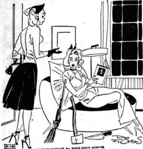
"Pretty good mystery story, huh?"