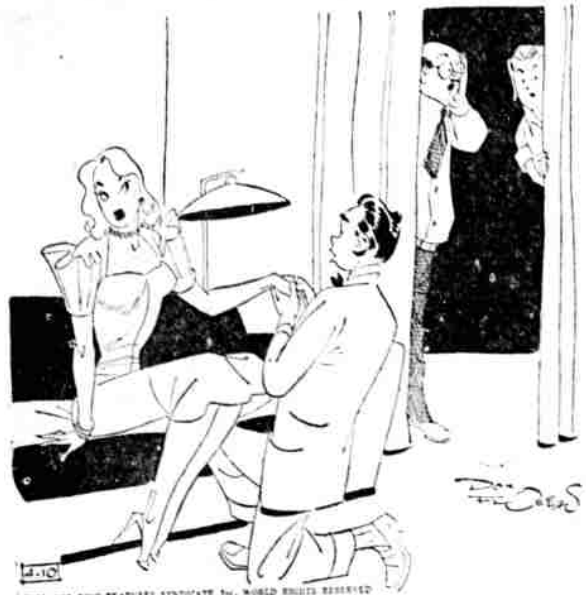
"She always says 'yes' so they'll take her out to celebrate."