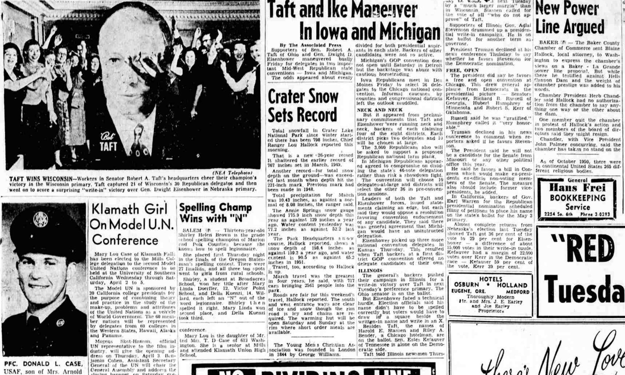
TAFT WINS WISCONSIN—Workers in Senator Robert A. Taft's headquarters cheer their champion's victory in the Wisconsin primary. Taft captured 21 of Wisconsin's 30 Republican delegates and then went on to score a surprising "write-in" victory over Gen. Dwight Eisenhower in Nebraska primary.