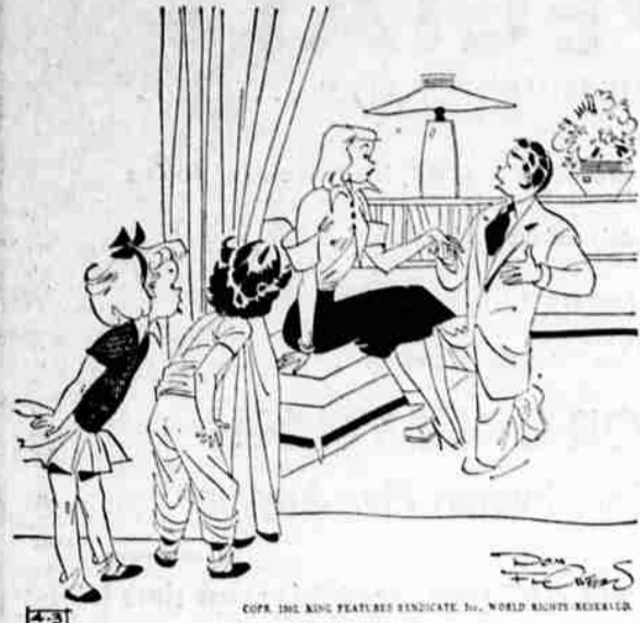
"Now he's goin' into his commercial."