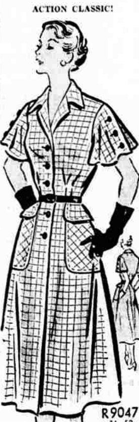
by Marian Martin CAPE SLEEVES that button! These give you such freedom of action. Reach, bend, sweep, bowl, golf—this dress won't pull, bind, or rip! A beautiful classic equally at home on fairway or in town, you'll wear this all summer to look your coolest and handsomest!