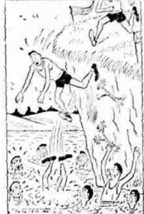
"I'd just like to get my hands on the joker who switched the markers for our cross-country race!"