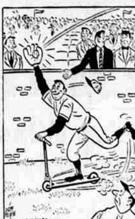
"I told you all's not well with him... notice how he favors his right leg?"