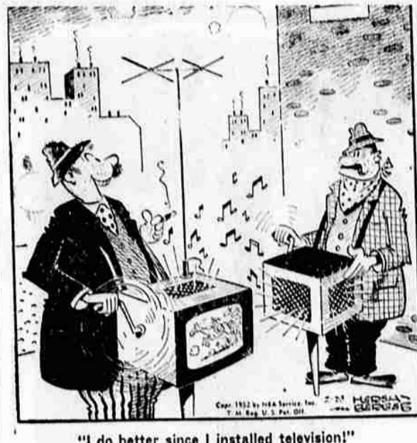
"I do better since I installed television!"