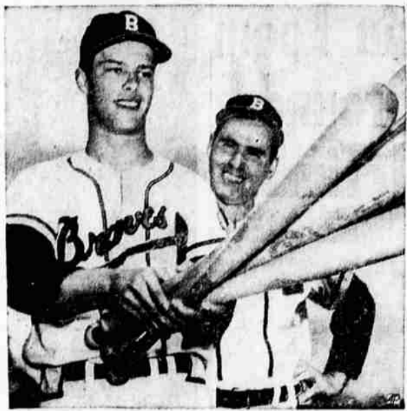
PRIZE ROOKIE — Manager Tommy Holmes (right) smiles approvingly as he watches his prize rookie, Ed Mathews, select some war clubs. The 20-year-old Mathews is a long-ball hitter who is trying to win the third base job on the Boston team.

WATERFILL AND FRAZIER DISTILLERY CO., BARDTOWN, NELSON COUNTY, KENTUCKY