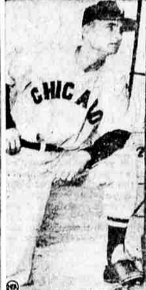
HIGH HOPES — Paul Richards smiles faintly as he watches his team work out at Pasadena, Calif., no doubt highly pleased with what he sees. The Chicago White Sox manager predicts another good year for his men, says they may even cop the pennant.