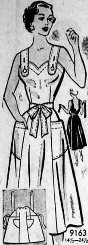
by Marian Martin

WRAP-ON! It's your versatile Apron-Sundress and in your own half size. No alteration or fitting worries for the woman with a shorter, fuller figure. Made in a jiffy. Easy sewing—and opening out flat, it's easy to iron. A "must" for summer.