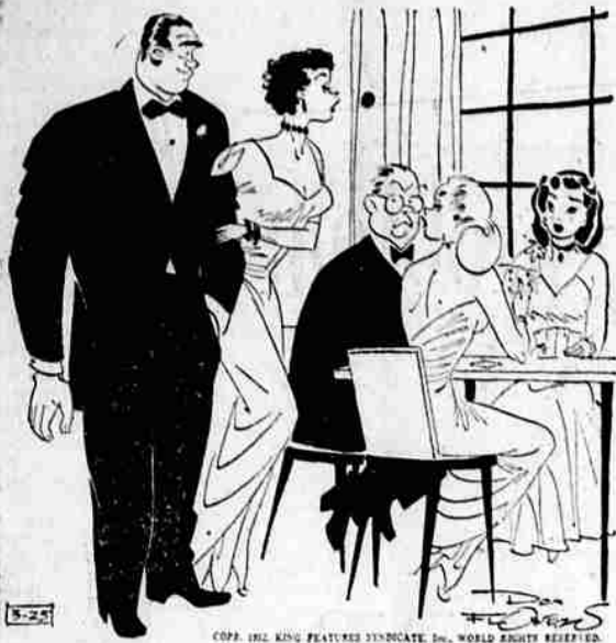
"He can't play bridge or canasta, but he can tear two decks of cards in half!"