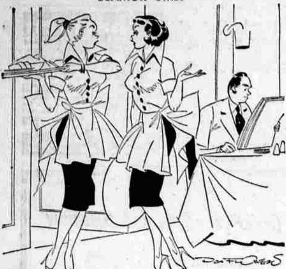
"He ordered hash! Looks like a good matrimonial prospect."