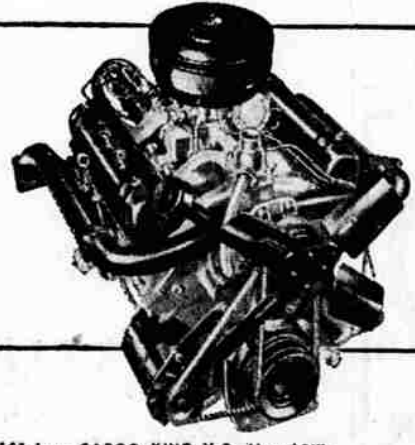
145-h. p. CARGO KING V-B: New LOW